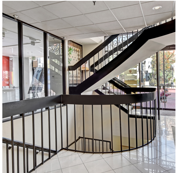
Recently renovated lobby